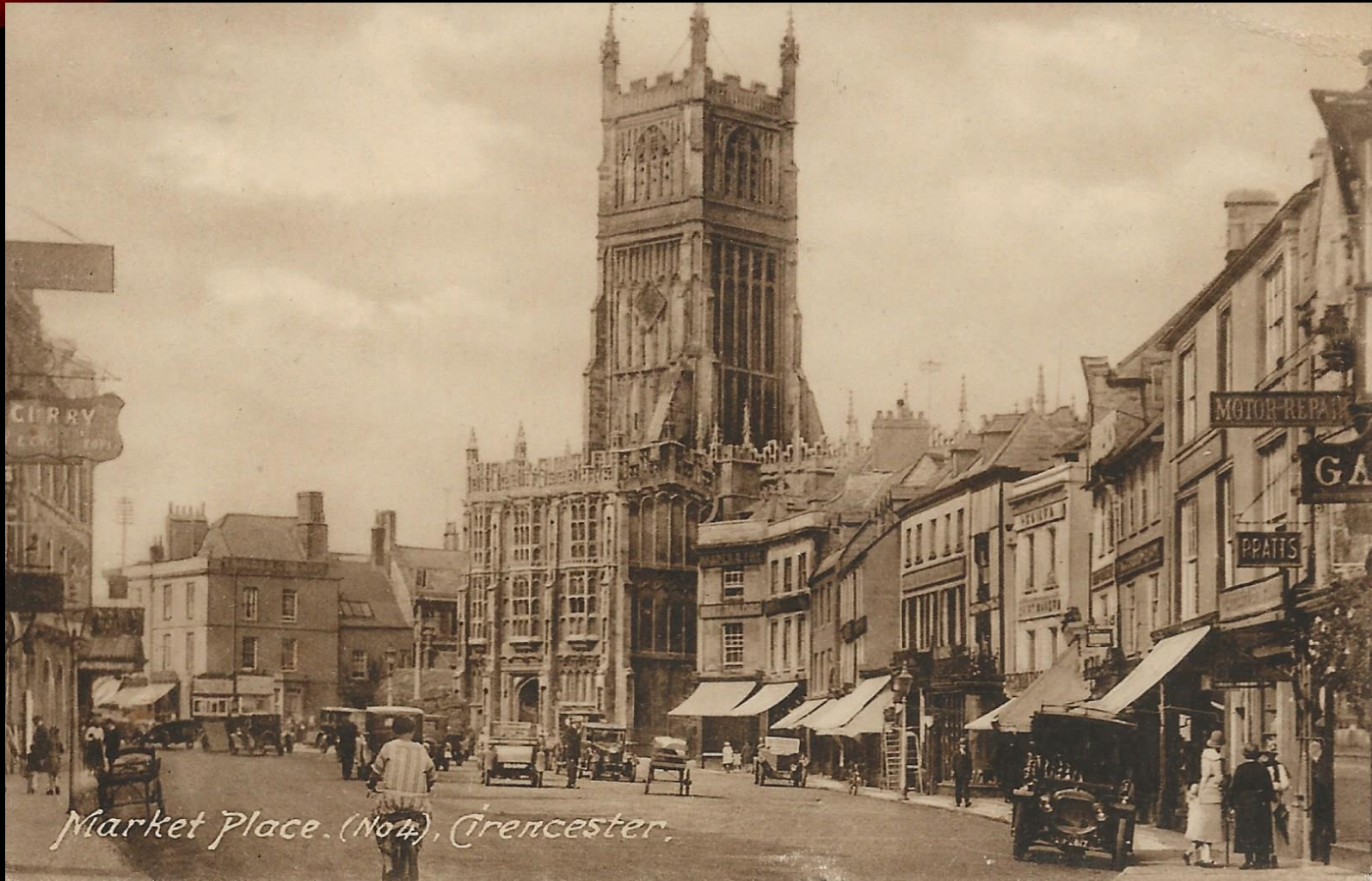
Market Place. (No. 4), Cirencester.