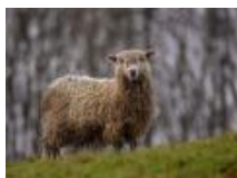
"Winter Cotswold sheep"