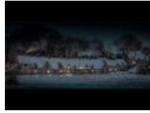
"Cold out, Warm in"