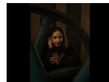
"Jaz through the wheel"