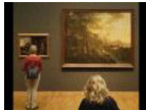
"Little and Large"