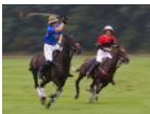
"The follow through"