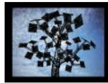
"Solar panel tree"