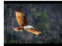
"Thai Red Backed Sea Eagle"