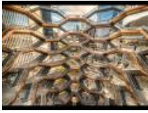
"The Vessel, New York"