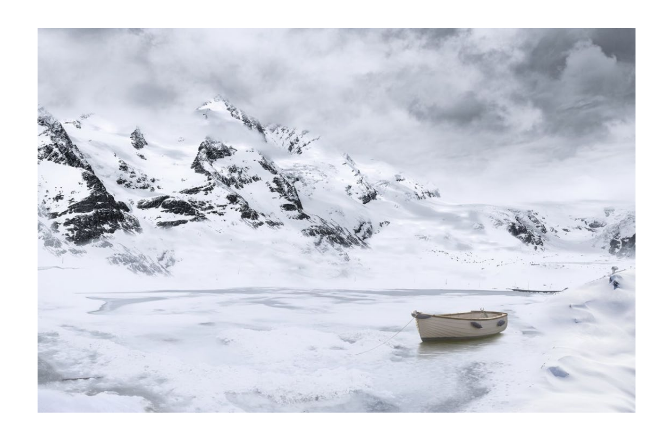
Going Nowhere by Shaun Little