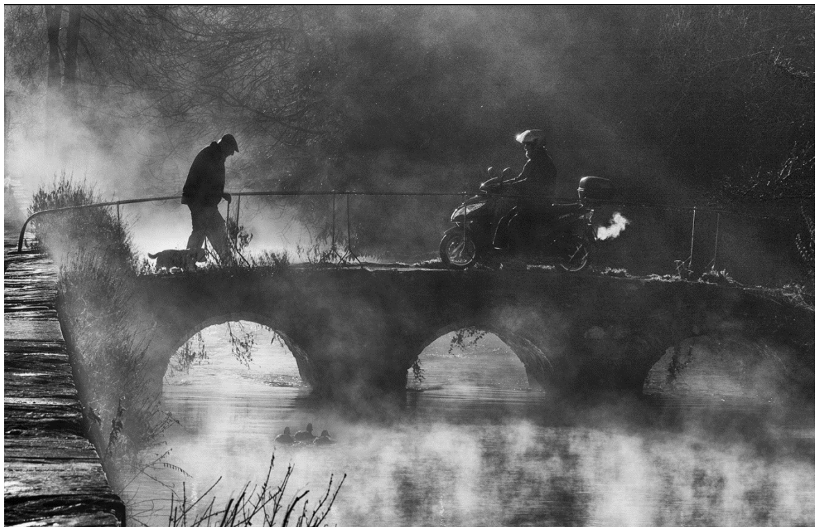
Frosty Encounter by Mike Cheeseman

Here are the winning images from each of the four sections: