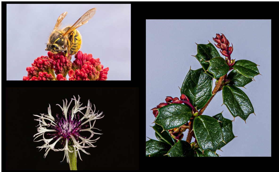
Focus-stacked Images