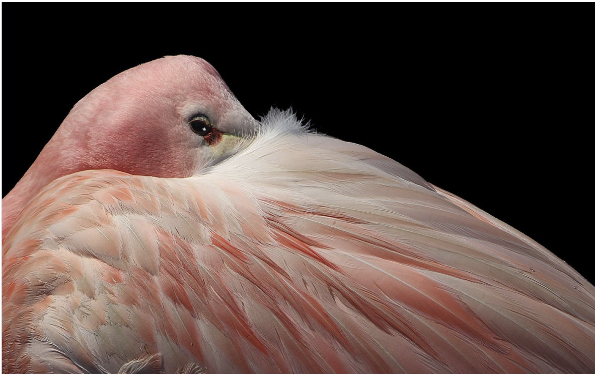
Pretty Flamingo by Fin Simpson