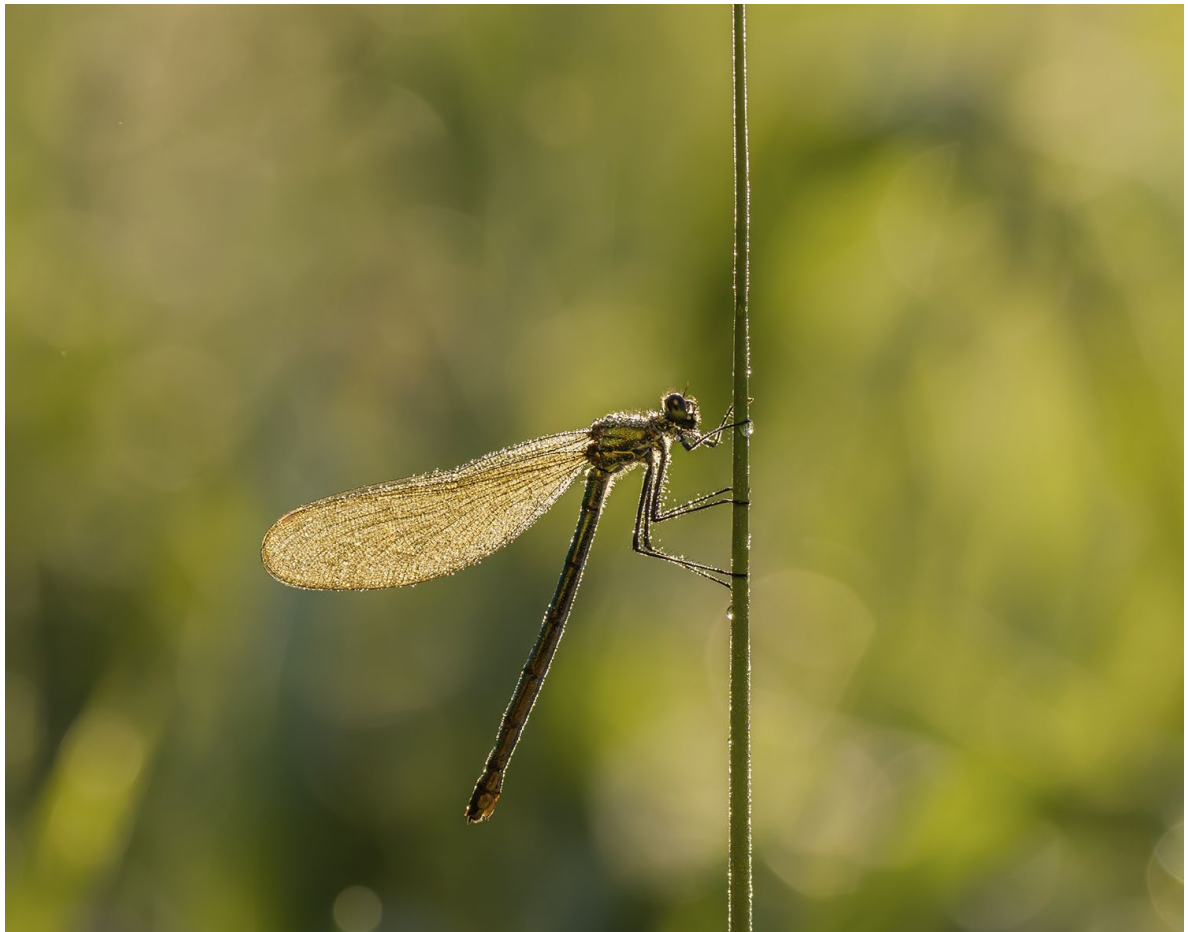
Catching the Light by Jill Bewley