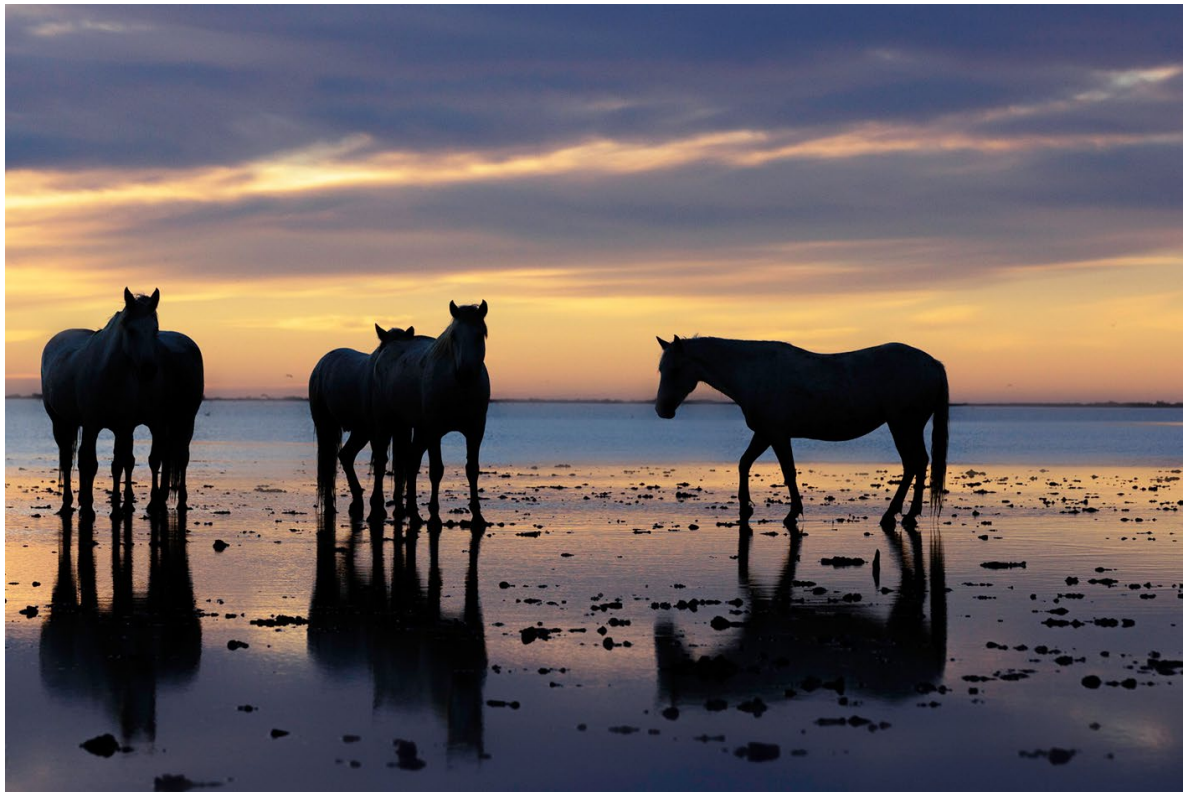
Waiting For the Day to Begin by Tricia Lindsay