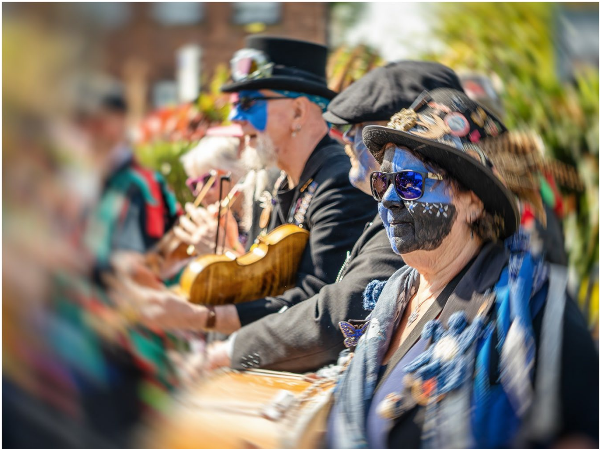
An Oasis of Calm by Dave Cahill

Once again 13 different winners out of 24 with a few of our new members getting a shout out. Well done everyone.