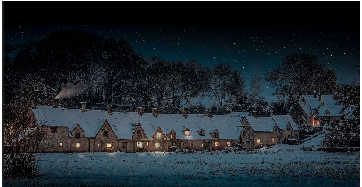
Cold Out Warm In by Mike Cheeseman (13) (1 st Place in Club Comp)