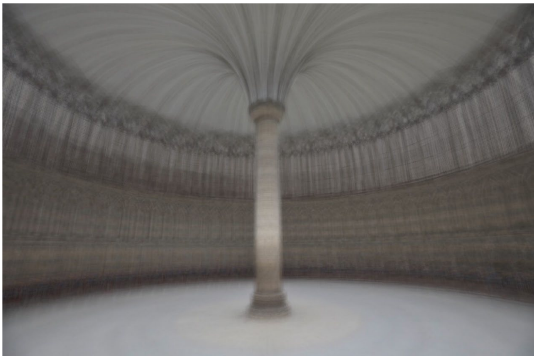
Chapter House 360 Worcester by Gary Gleghorn (12) (2 nd in Club Comp)