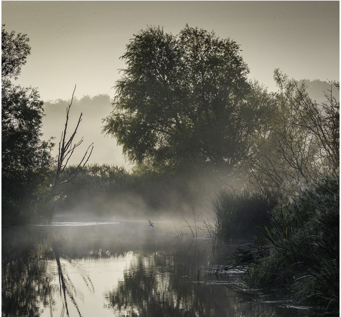
3 rd : Misty Morning with Kingfisher by Gary Gleghorn