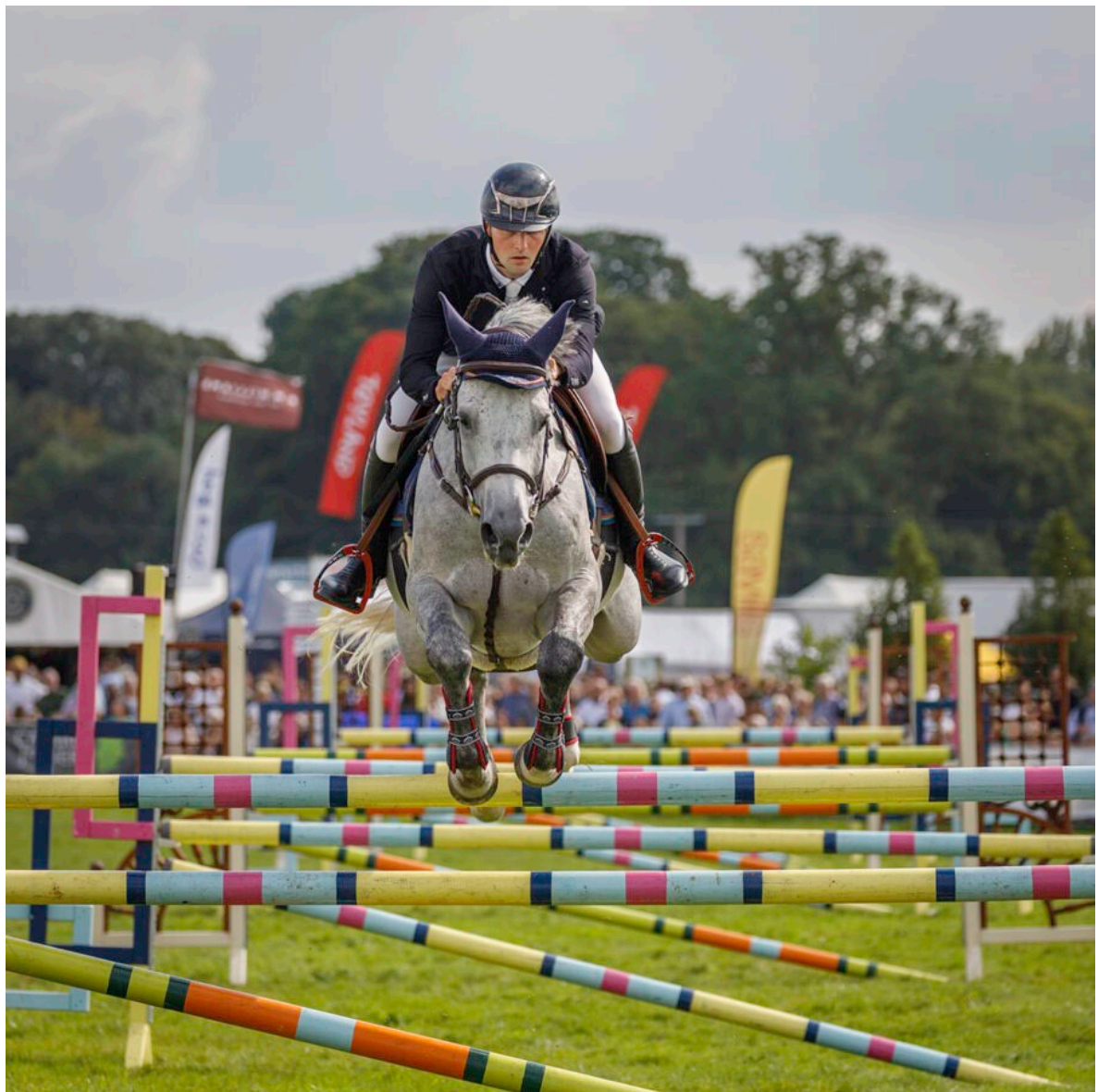
1 st : High Jumper by Gary Gleghorn