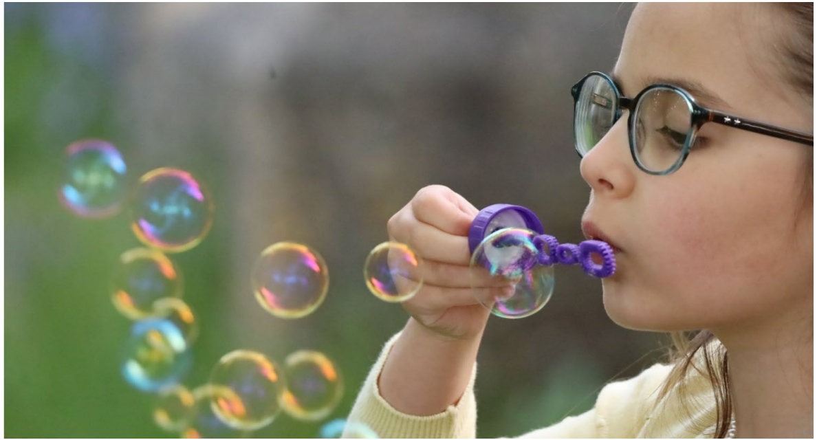
Blowing Bubbles by Paul Norris