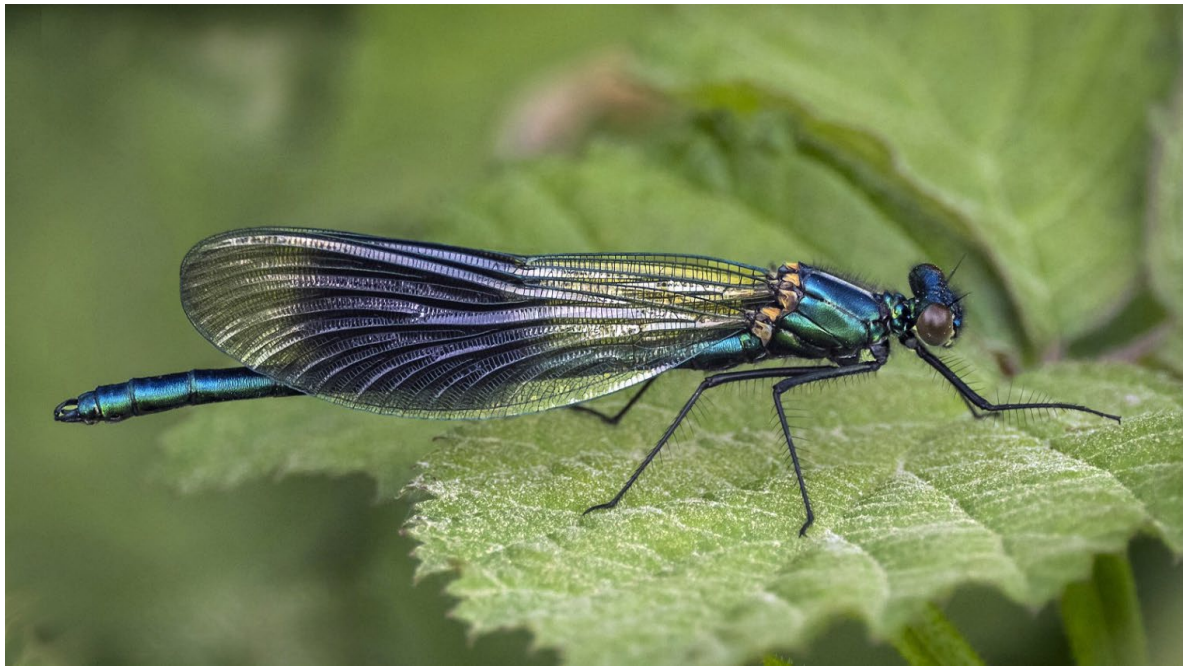
Banded Demoiselle