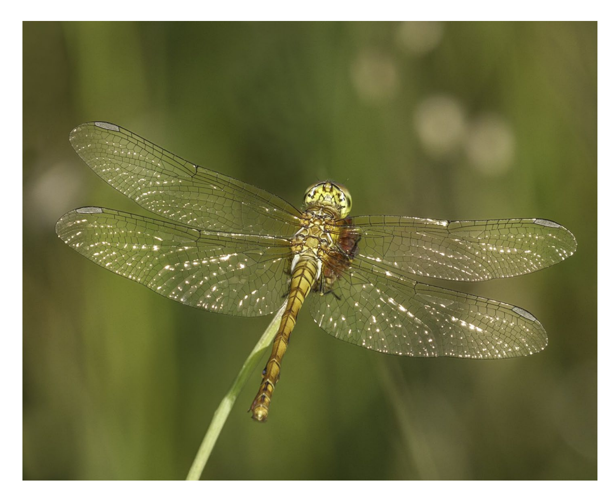
Ruddy Darter