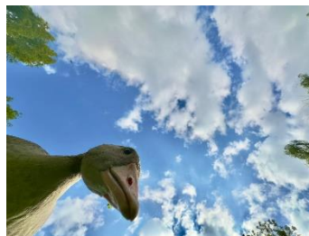
2 - Mike