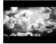
✔ White and Woolly - Mike Cheeseman

Good luck to everyone and good luck to Cirencester Camera Club!