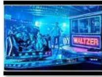
✔ Waltzing the Blue Light - Dave Cahill