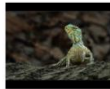
✔ Hermidactylus Parvimaclatus Gecko