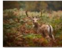
✔ Where are you- Paul Norris