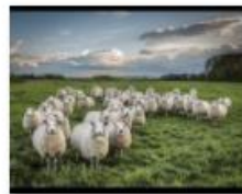
✔ Hello Stranger - Gary Gleghorn