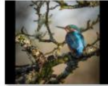
✔ Autumn Kingfisher - Gary Gleghorn