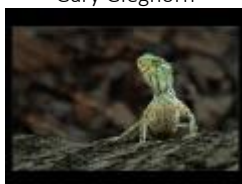
Hermidactylus Parvimaculatus Gecko