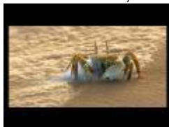
Maldivian Ghost Crab