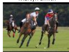
Hockey on Horseback