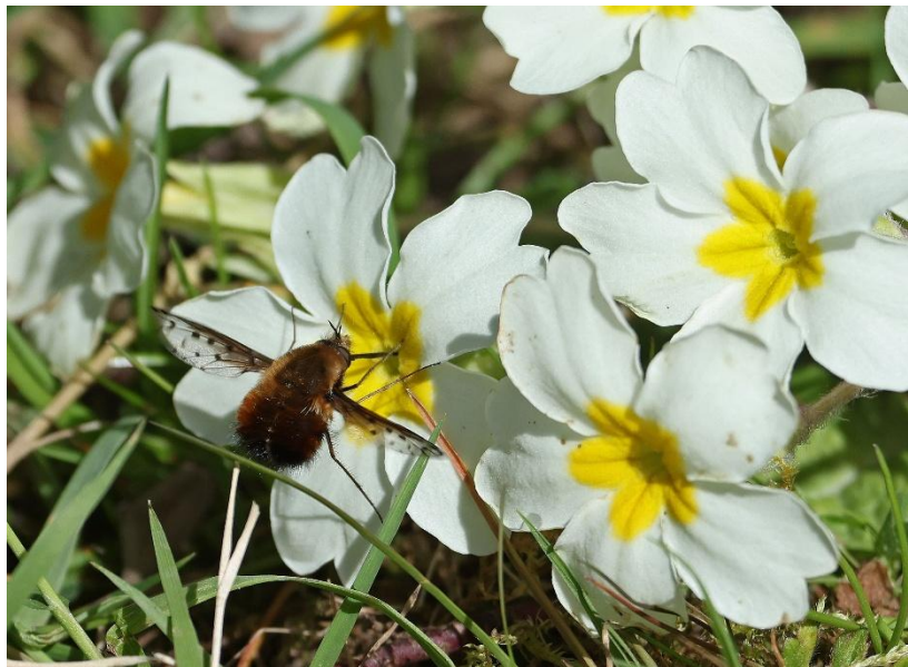
A female dotted bee-fly nectaring on a primrose and...

We had a chat about using a telephoto lens for macro images, something photographers overlook and John sent me a couple of images using his Canon R7 and 200-400 L F4 to prove the point: