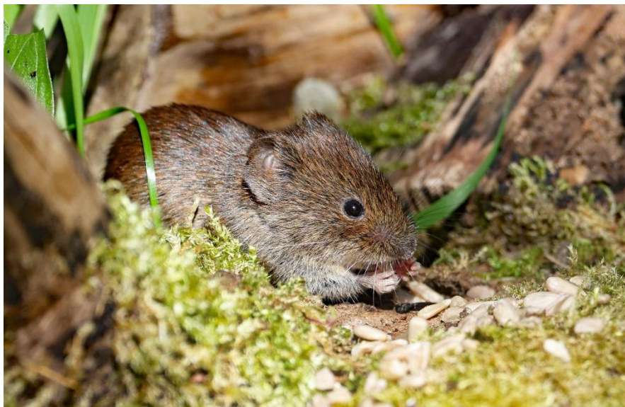
A bank vole. All taken in the Cotswold water park.